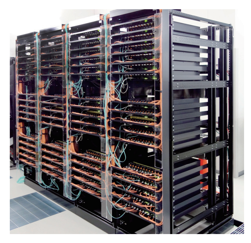
Fig. 3. MDGRAPE-4 system with 512 chips in 64 subracks.